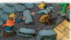
Adding roof tiles