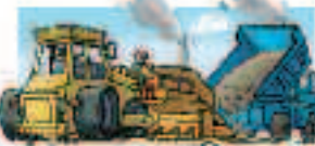
Building a road