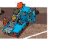
Loading the plane