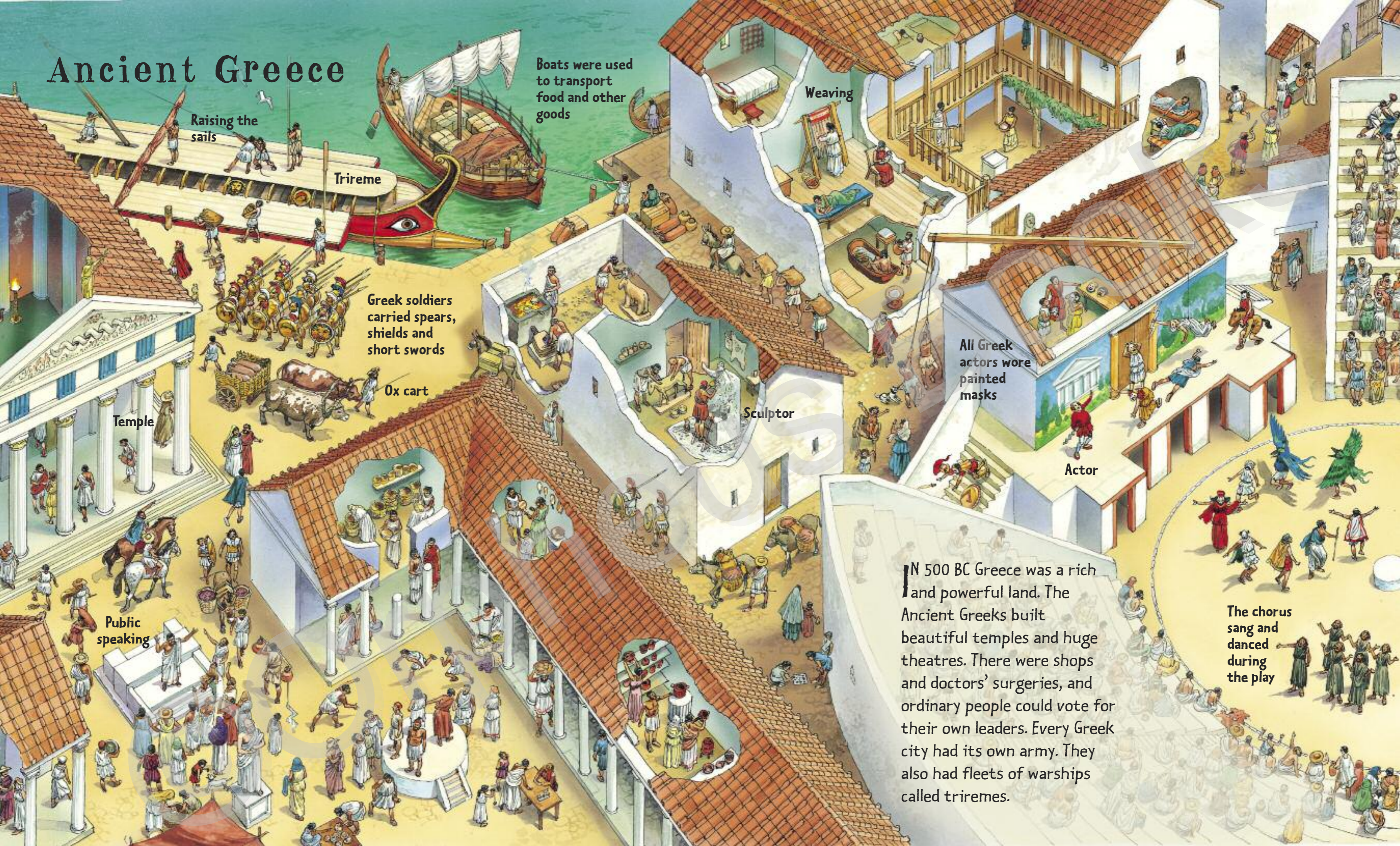
Raising the sails