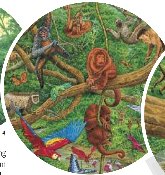
The canopy community