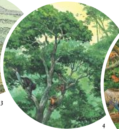
The rainforest canopy ecosystem