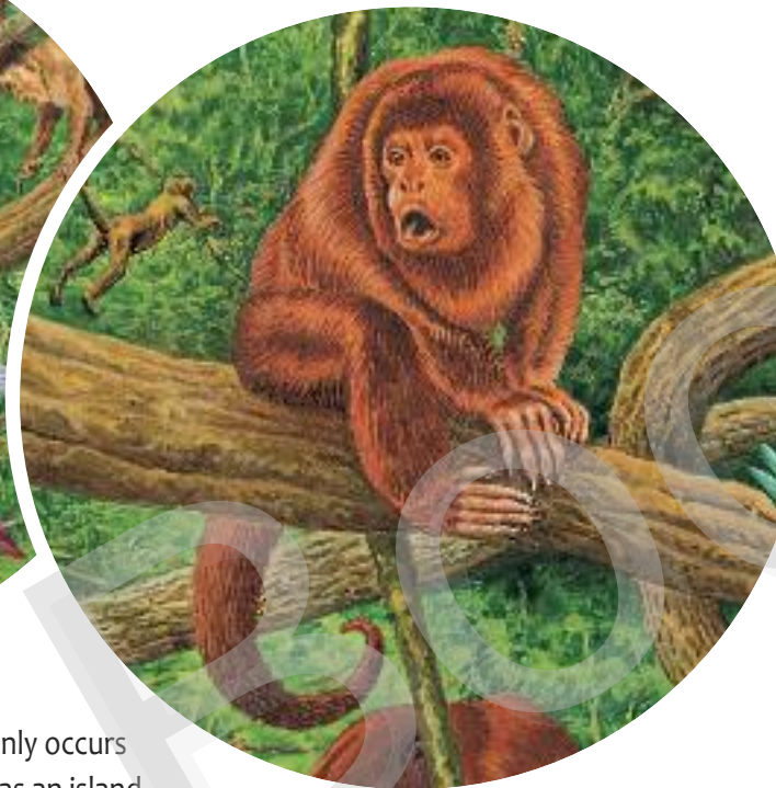
A howler monkey

Ecologists divide Earth's biosphere (1) into smaller units: biomes (2) (→10), ecosystems (3), communities (4) and niches (5).