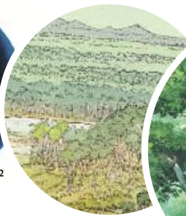
The rainforest biome