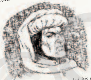
FIG 8. Geoffrey de Beauville ruled his castle and surrounding lands with a rod of iron.

A BARON OVERTHROWN CASTLES had, by the end of the 13th century, become extremely strong. The only way one could be taken was to surround it with an army and prevent any food or water entering it. Such sieges could last several months or even years. It was a remarkable turn of events, then, that saw the successful capture of the castle belonging to one Geoffrey de Beauville, a powerful baron, in 1295. The baron had a reputation for exceptional cruelty. On one infamous occasion he ordered all the crops and livestock on his lands to be burned, so that every one of his tenants and their families would starve. His castle, widely reputed to be all but impregnable, fell to the besieging army of a neighbouring baron in a matter of hours. No one has been able to discover how this extraordinary feat was carried out, although it is strongly rumoured that spies in the castle played an important role.