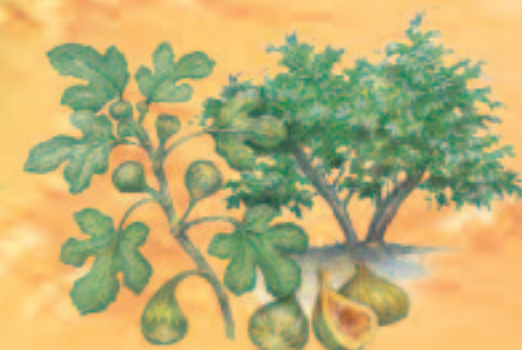
FIG TREES provided shelter from the sun as well as rich fruit to eat.

WILD animals such as lions and wolves were common in the remoter areas. Warriors were often measured by their strength against these beasts. Samson was said to have wrestled a lion with his bare hands.